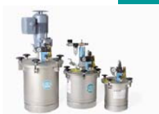
Cuves sous pression