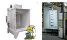
Cabines manu et auto